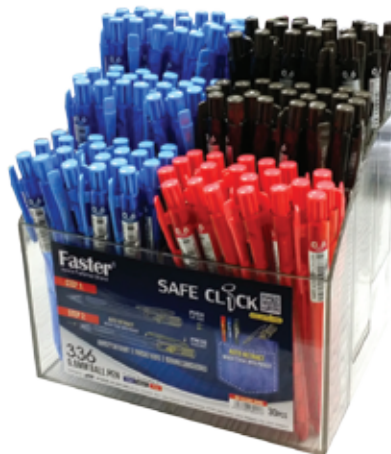
Display Set Packaging Available in 120 pcs/set