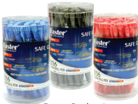
Drum Packaging Available in 30 pcs & 50 pcs