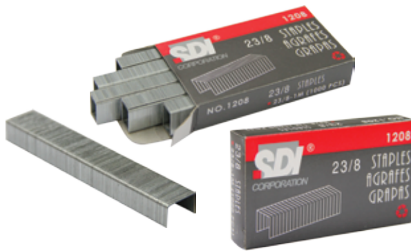
BOX OF 1000 PCS