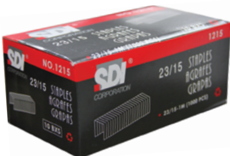
MED BOX OF 10 BOXES