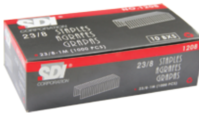
MED BOX OF 10 BOXES