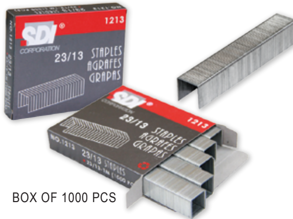
BOX OF 1000 PCS