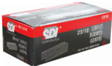
MED BOX OF 10 BOXES