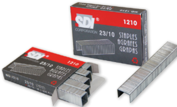
BOX OF 1000 PCS