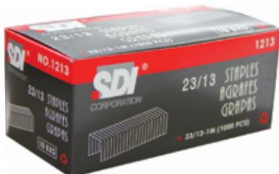
MED BOX OF 10 BOXES