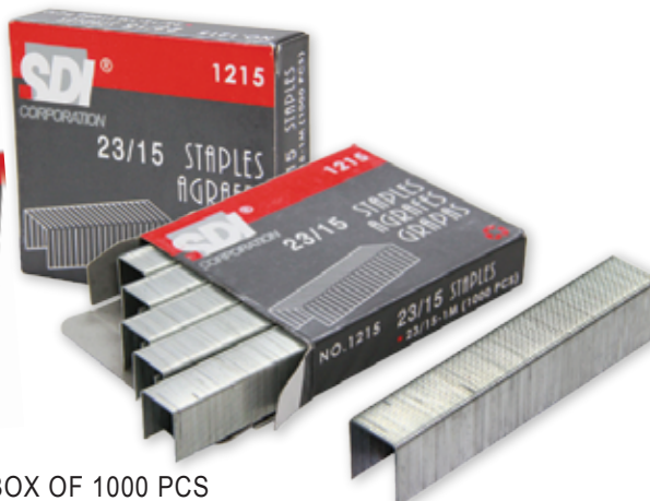
BOX OF 1000 PCS