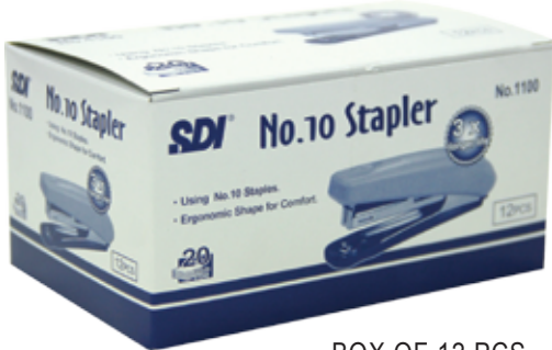
BOX OF 12 PCS