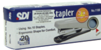
BOX OF 1 PC