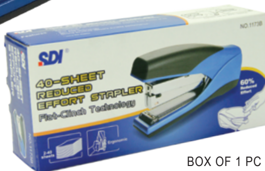
BOX OF 1 PC