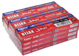
MED BOX OF 144 PCS

Pearlish and glossy barrel finishing 珠光亮漆笔杆