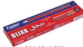
BOX OF 12 PCS