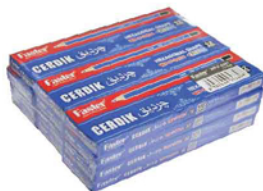
MED BOX OF 144 PCS

Pearlish and glossy barrel finishing 珠光亮漆笔杆