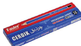
BOX OF 12 PCS